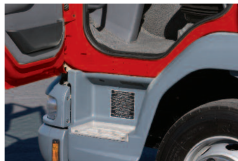
Entry and exit are safer and easier with stair-style steps with non-slip treads and ergonomically positioned doors that open a wide 90 degrees.