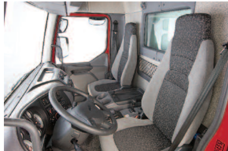
A wraparound dash highlights the spacious interior. The ergonomic design and automotive feel combine to enhance driver comfort and productivity.

The Model 220 is a beautifully compact package offering driver comfort, easy service, entry safety features and vigorous power. It's ideal for pickup and delivery, towing, refrigerated van, roll-off and landscaping applications.