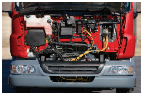
Service checks are easy. The front panel opens for quick access to the air filter, coolant, washer fluid, power-steering fluid, refrigerant and engine oil.