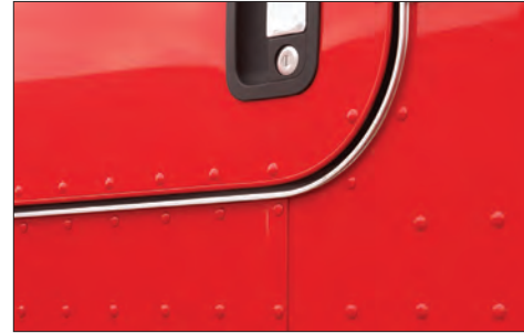
A lightweight all-aluminum cab with huckbolt fasteners, lap seam construction and bulkhead style doors is the leader in toughness, corrosion resistance and water-tight performance.