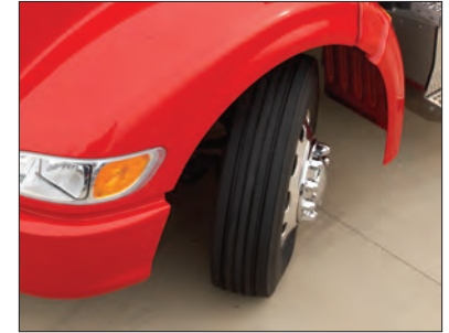
A new chassis design features optimized front axle placement for excellent maneuverability and handling. Components are positioned for convenient access to key service points.