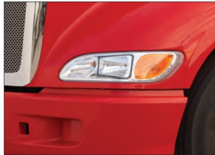
Integrated headlamps provide a high-intensity forward lighting system for improved visibility and a tough Lexan lens is impact resistant and requires no special tools for lamp adjustment or bulb replacement.