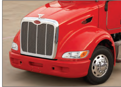
A dramatically sloped hood with swept-back fenders, a contoured, advanced composite bumper and aero tool box to enhance aerodynamics.