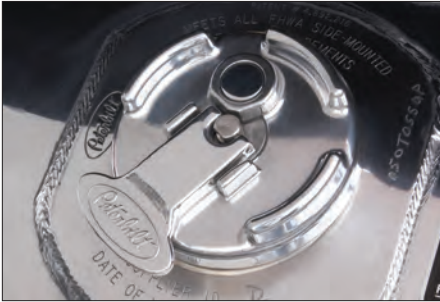
The signature Peterbilt fuel cap is mounted to a precision-crafted aluminum fuel tank, and is a distinctive representation of the outstanding fuel economy of the Model 386 Day Cab.