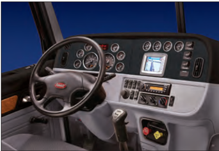
The ergonomic Prestige cab interior features a new charcoal dash that reduces glare improving driver visibility, is scratch resistant and provides LED backlit gauges and a powerful new HVAC system for improved overall performance.